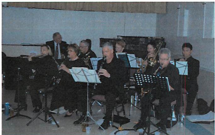
The Stittsville Legion Concert Band