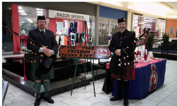
At Hazeldean Mall.