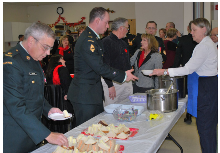
Remembrance Day Reception at the Branch