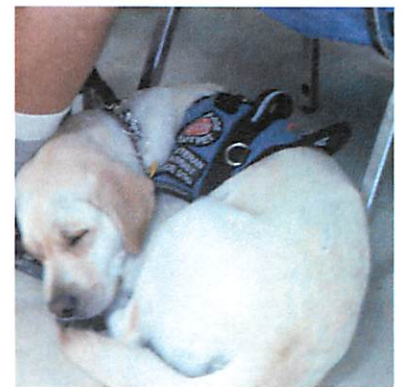
Long walk from Nova Scotia