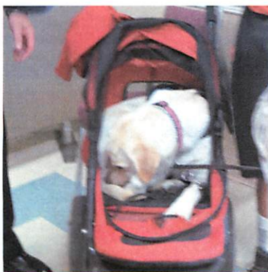
Therapeutic dog, eh?