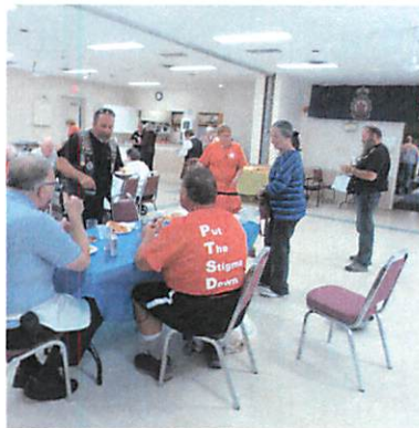
Badges and dogs