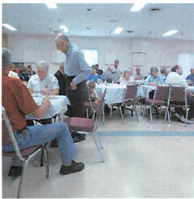
A good turn-out